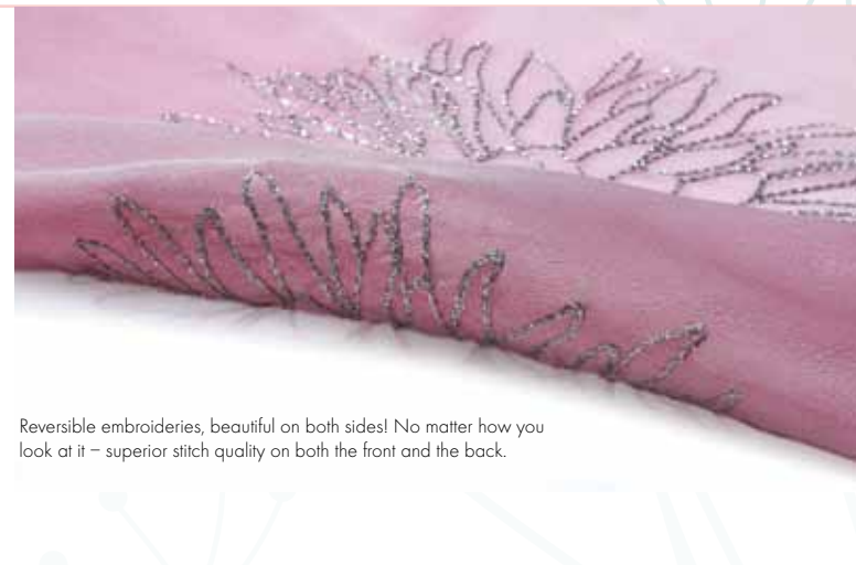
Reversible embroideries, beautiful on both sides! No matter how you look at it – superior stitch quality on both the front and the back.

Go to www.pfaff.com and see how this triumph of technology works!