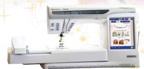
2004 DESIGNER SE™