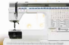
1989 MODEL 1100

Visit www.husqvarnaviking.com to explore more about our historic products.