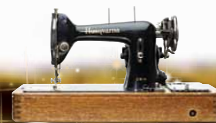
1934 CBN CLASS 12