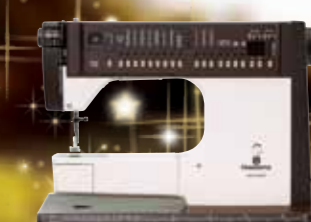
1979 MODEL 6680