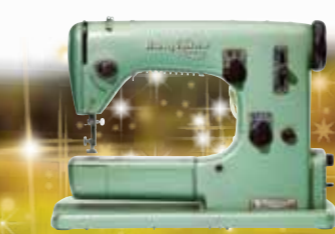
1953 CLASS 20