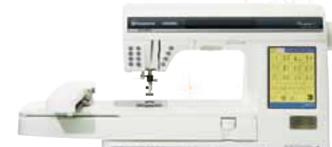
1998 DESIGNER I™