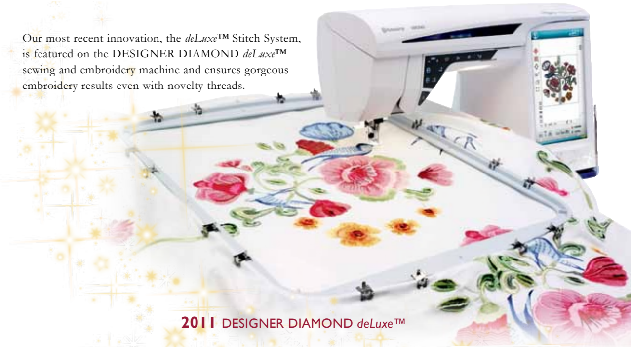
2011 DESIGNER DIAMOND deLuxe™

Our most recent innovation, the deLuxe™ Stitch System, is featured on the DESIGNER DIAMOND deLuxe™ sewing and embroidery machine and ensures gorgeous embroidery results even with novelty threads.