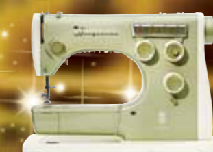
1960 MODEL 2000