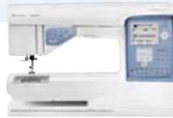
SAPHIRE™ 875 QUILT