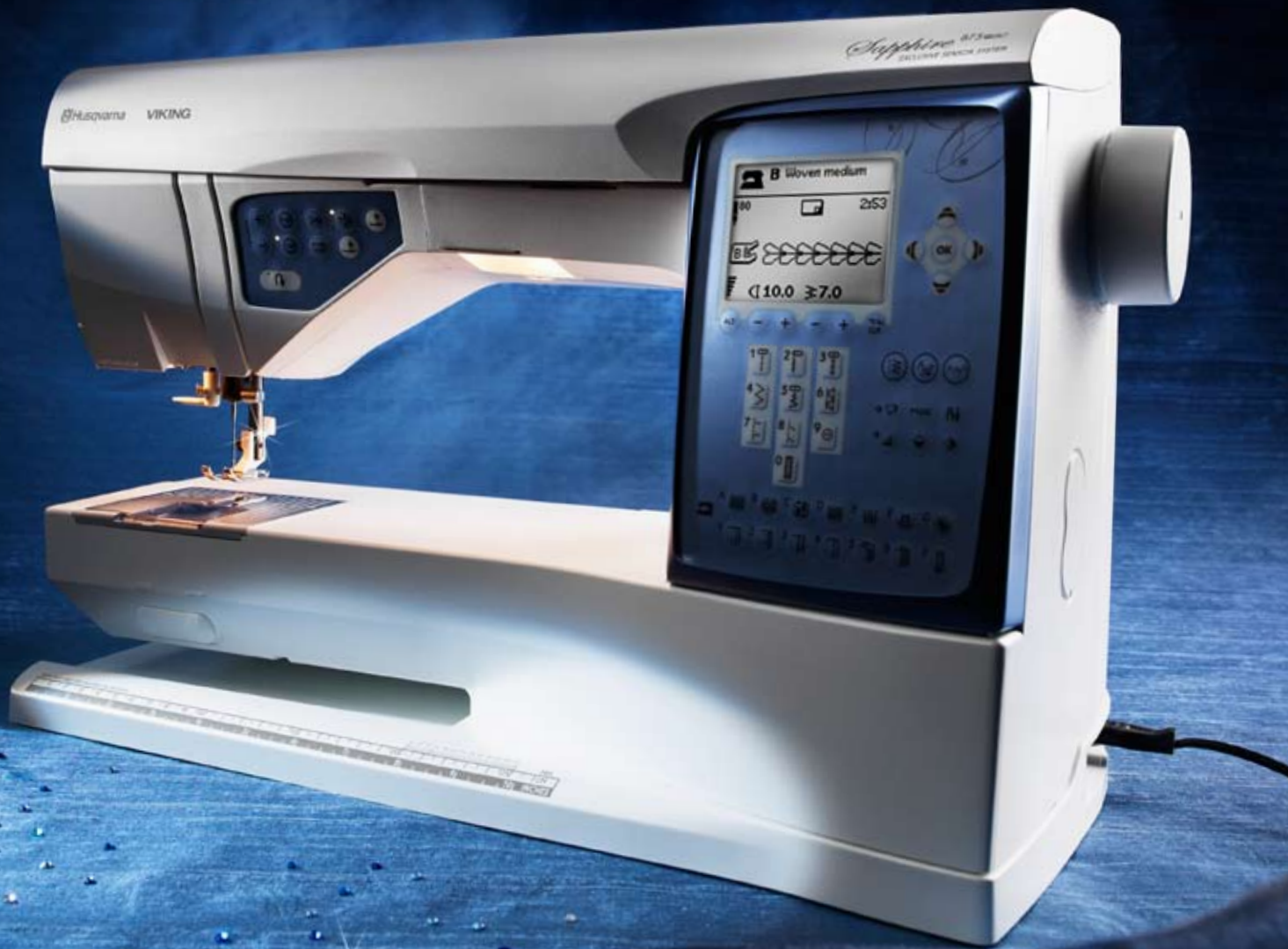
Sapphire™ 875 Quilt